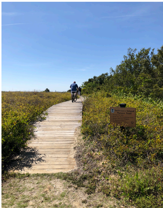
Station 16 – Nature Trail, Sullivan's Island