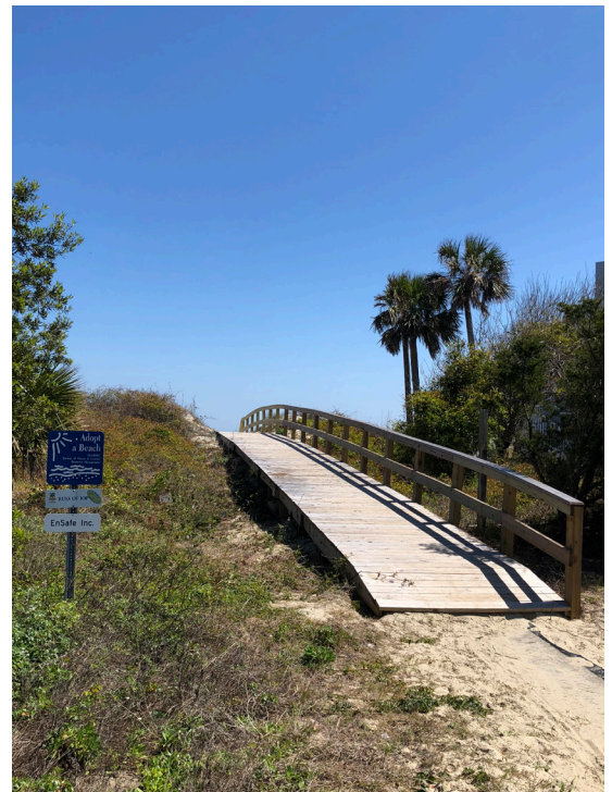
Image: Station 29 Sullivan's Island

SCPRT offers opportunities to local jurisdictions through a Parks and Recreation Development Fund (PARD). PARD is State funding that can be used for the development for new park and recreation trails or facilities, or an enhancement of existing facilities.