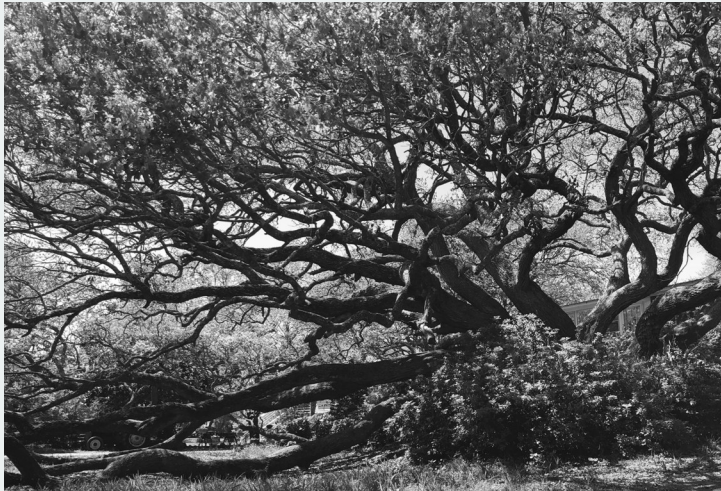
The "Goldbug Tree," made famous by Edgar Allen Poe's short story, is protected and currently located on a privately owned residential property.

Any tree with a diameter of 6" or greater is protected on Sullivan's Island and may only be removed by submitting a Tree Removal Permit by way of the Town's online permitting website. Any tree 16" in diameter, or greater, is considered a "significant" specimen and must be approved for removal by the Tree Commission . Tree Protection Zones (TPZ) must be established around any protected tree located within the limits of disturbance ahead of commencing any permitted construction project; the TPZ shall be a minimum of 1-foot radius per inch of the tree trunk's DBH.