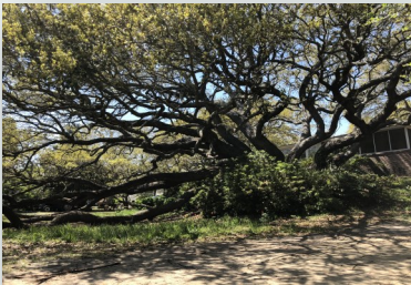
The "Goldbug Tree," made famous by the Edgar Allen Poe's short story, is protected and currently located on a privately owned residential property.