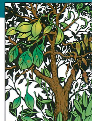
Leaf appearance assists in diagnosing disease.

Twisted or curled leaves may indicate viral infection, insect feeding, or exposure to herbicides. The size and color of the foliage may tell a great deal about the plant's condition.